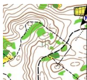
1 st stage