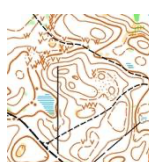
2 nd and 3 rd stage