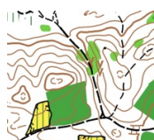
1 st Stage